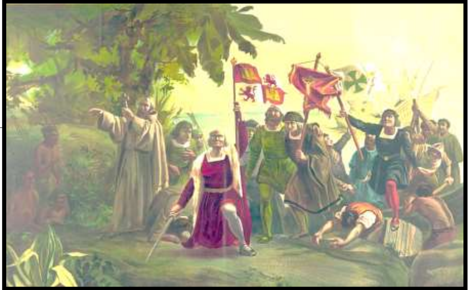
First landing of Columbus on the shores of the New World, at San Salvador, W.I., Oct. 12th 1492 , Dióscoro Teófilo Puebla Tolín