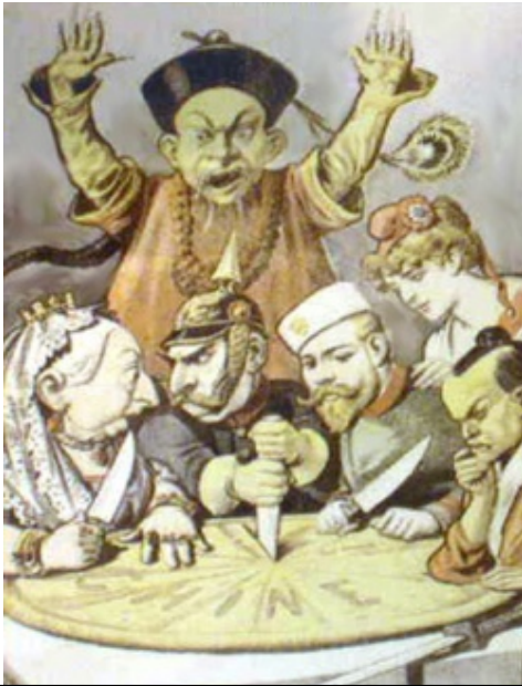
In this cartoon, a figure representing China tries to stop the European nations (from left, Britain, Germany, Russia, and France) and Japan from dividing up a large "China" pie.

During the 1800s the United States had a growing interest in China. American businessmen wanted to take part in lucrative trade in China, and missionaries wanted to convert the Chinese to Christianity. In the late 1800s the ruling Manchu dynasty in China grew weak and unstable. China's military power was not enough to defend it from the imperialist interest of other nations. As a result, Russia, Japan, Britain, France, and Germany each took control of a specific region of China during the last two decades of the 19 th century. These regions became known as "spheres of influence." In their respective spheres, the imperialist nations demanded that China give them special trade privileges and lease them land on which to build naval bases to protect their strategic interests.