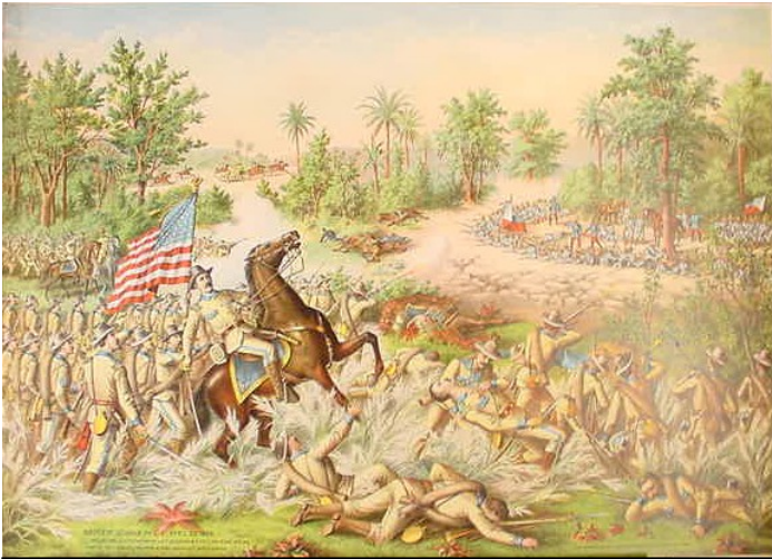
The Battle of Quingua, April 1899, was one of the first major battles of the Filipino-American War. In the picture above, American soldiers under Major Franklin Bell are attacked by Filipino troops. The Americans eventually won after a bloody battle.

During the Spanish-American War in 1898, the United States sought to take over the Philippines, a Spanish colony. U.S. commodore George Dewey entered into collaboration with Filipino patriot Emilio Aguinaldo, who had led an uprising against Spain in 1896. The rebellion had successfully ousted Spanish rule in all territories of the Philippines except for Manila, the capital city. With the help of Aguinaldo and his rebels, the United States captured Manila on August 13, 1898. Aguinaldo joined the U.S. effort with the belief that the United States would grant the Philippines their independence after Spain was defeated. However, after the successful takeover, Dewey denied having given any such assurances and claimed Aguinaldo was mistaken.