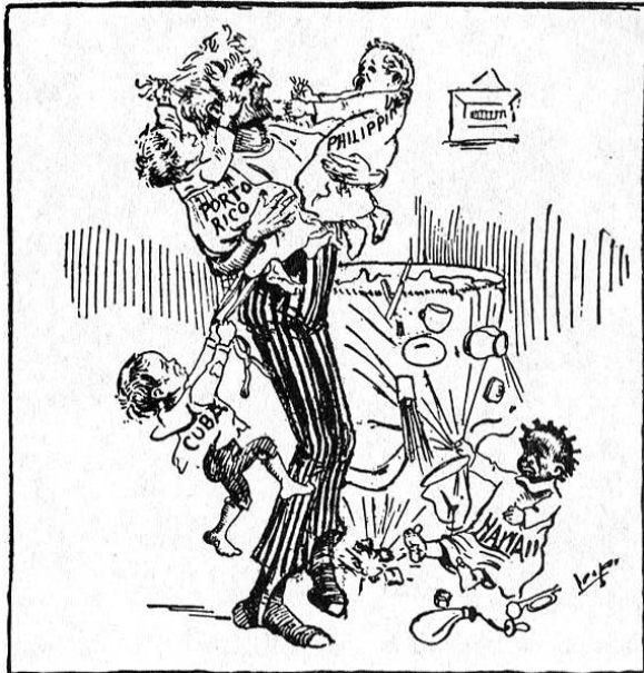
This cartoon shows Uncle Sam holding and surrounded by screaming toddlers representing new territories acquired by the United States after the Spanish-American War of 1898.

In the 1898 treaty ending the Spanish-American War, Spain ceded Puerto Rico to the United States. The United States soon became the dominant power in the Caribbean – a region earlier controlled by European countries. Puerto Rico became a U.S. territory. The U.S. government selected a U.S. governor and executive council to rule the island, and appointed U.S. judges to the Puerto Rico Supreme Court. In spite of U.S. rule, as residents of a U.S. territory, Puerto Ricans were not American citizens and could not travel freely to the United States. This stipulation satisfied American labor leaders and politicians who opposed Puerto Rican immigration to the United States.