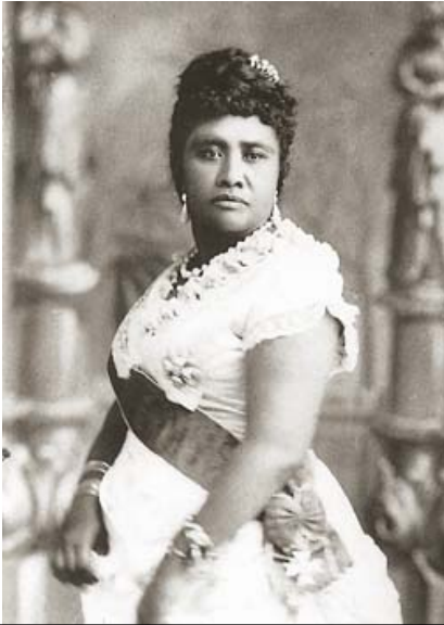
Hawaiian monarch Queen Liliuokalani, who resisted the United States' annexation of her island empire.

During the 18 th century, the United States became interested in the Hawaiian Islands as a way station and provisioning point for shippers, sailors, and whalers trading with Asian nations. New England missionaries preaching Protestant Christianity also settled in the islands in 1820. Many of the descendants of these missionaries became prosperous sugar growers who dominated the economy and government of Hawai'i. These Americans, as well as those on the West Coast, gradually came to regard the Hawaiian Islands as an extension of the United States and sought to gain more direct influence over the islands. During the 1840s the United States warned other powers to stay out of Hawai'i. In the late 1800s the United States made a commercial trade agreement with the Hawaiian government, followed by a treaty guaranteeing the United States a naval base at Pearl Harbor.